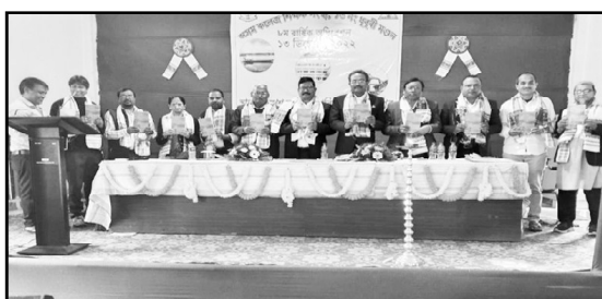
Photos of Book unfold at Zone Conference, 13 Dec/2022