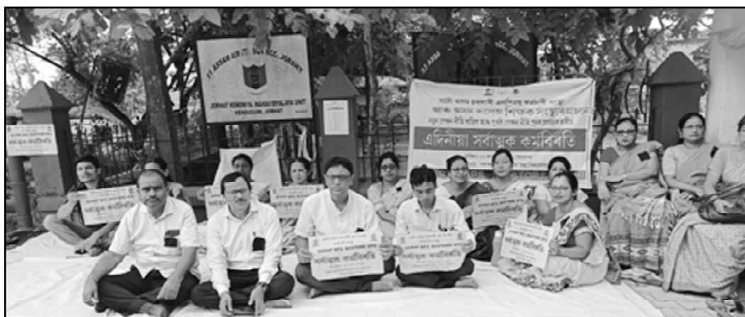
Photos of different programme & activities of Jorhat Zone