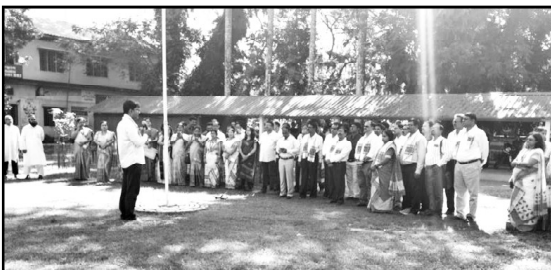
Photos of acta CENTRAL Women Convention, 22 Oct/2022