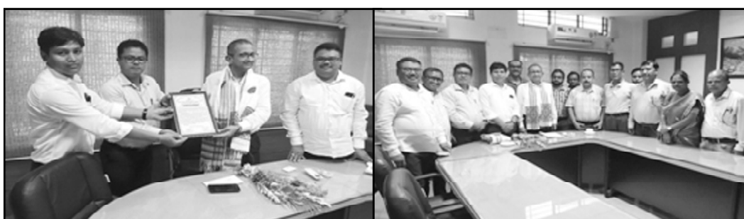
Felicitation to Honourable Vice Chancellor of Dibrugarh University