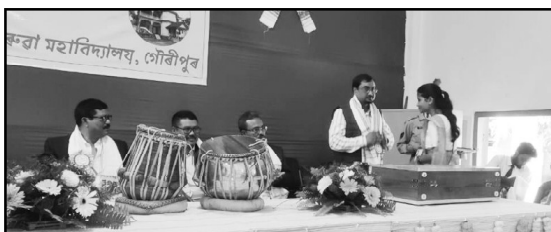
Photos of Zone Zone Annual Conference, 13th DEC/ 2022