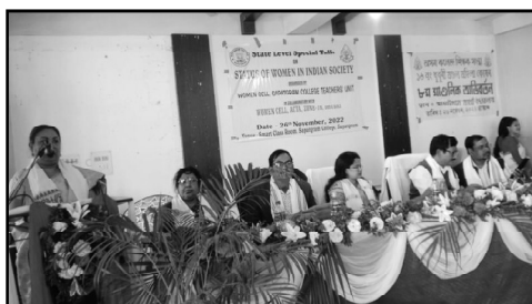
Photos of Zone Women Convention, 26th Nov/ 2022